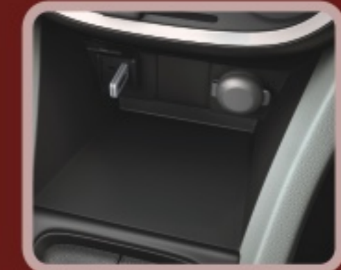
I/P CENTER POCKET