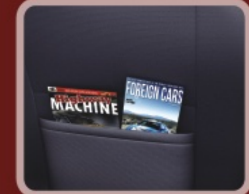
SEAT BACK POCKET (CO-DRIVER)