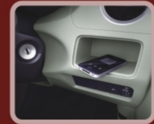
DRIVER SIDE POCKET