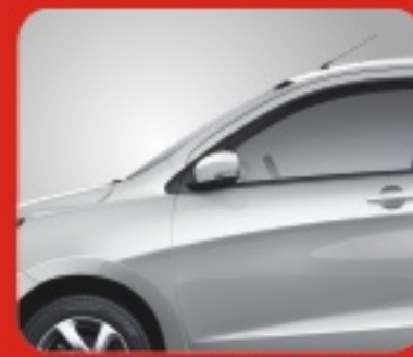
PEARL ARCTIC WHITE