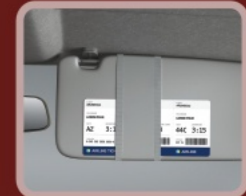
TICKET HOLDER IN SUNVISOR