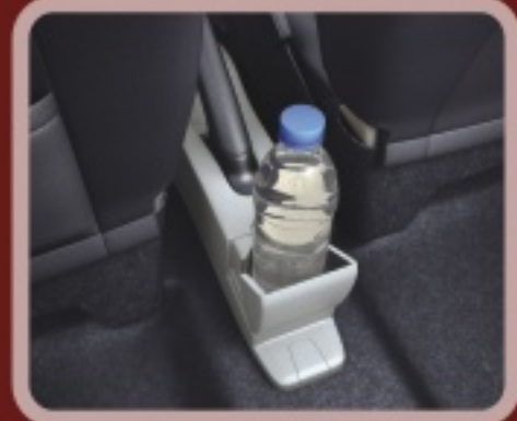
BOTTLE HOLDER 1 LTR