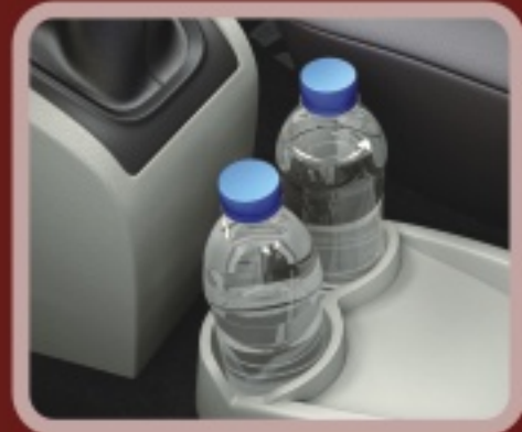
TWO 500 ML BOTTLE HOLDERS