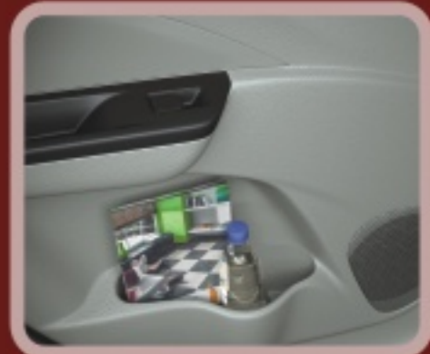
TWO REAR BOTTLE HOLDERS