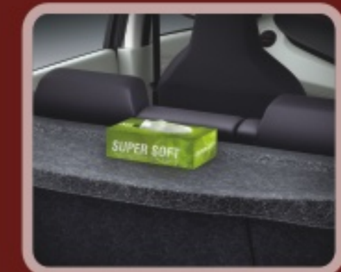
REAR PARCEL TRAY