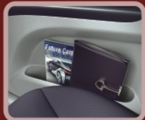
MAP POCKETS ON ALL FOUR DOORS