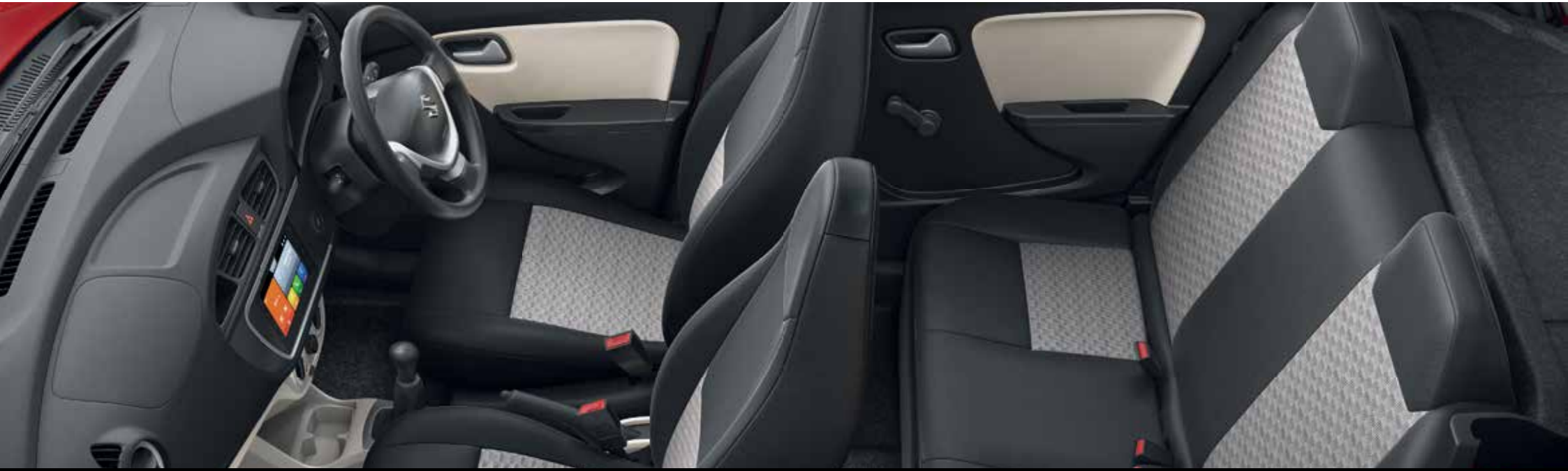
Stylish Dual Tone Interiors

A perfect blend of style and practicality, new Alto's upgraded interiors make it a universal favourite.