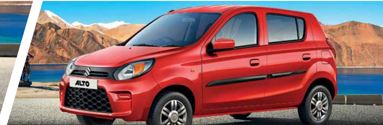
Bumper and Side Fender