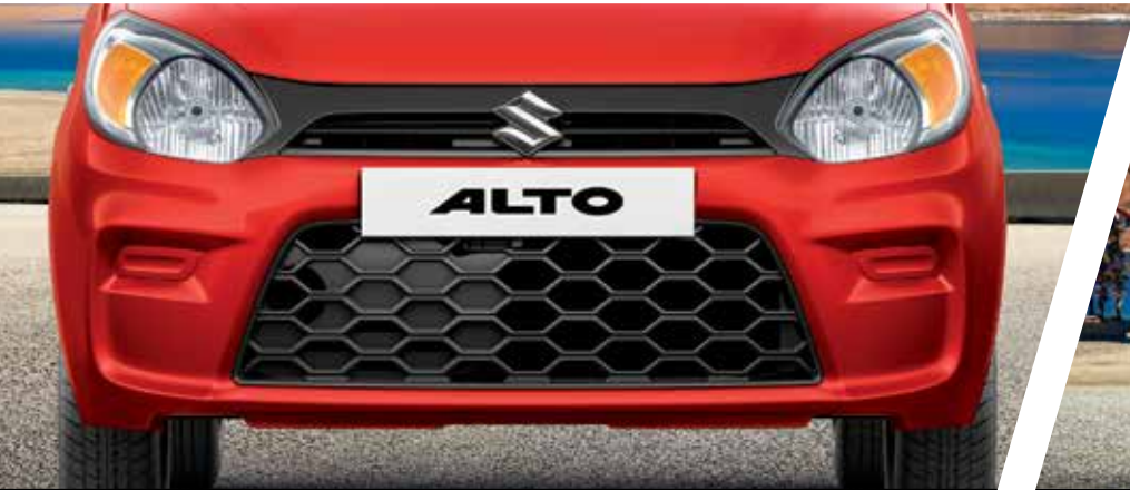
Dynamic New Aero Edge Design

The elegant new design lends a fresh appeal to the Alto, while also accentuating its distinct looks.