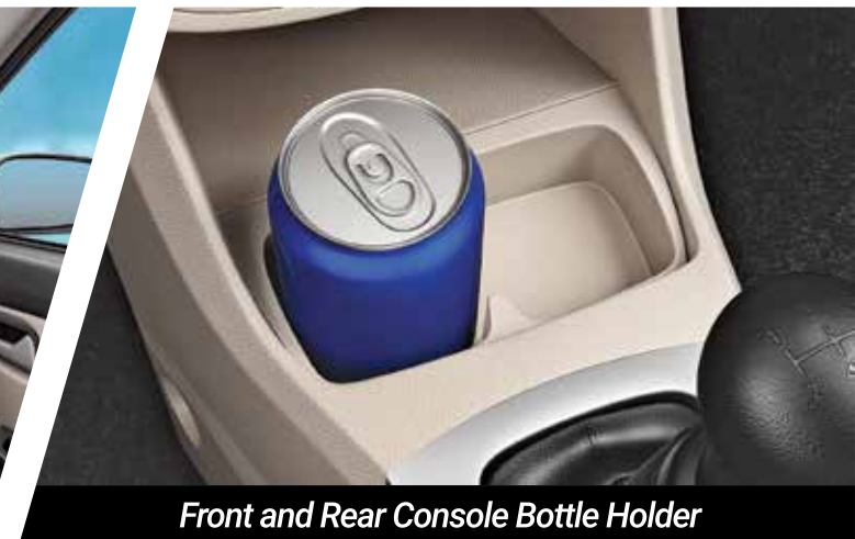
Front and Rear Console Bottle Holder