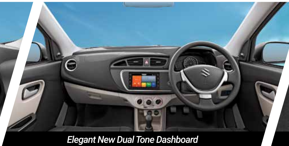
Elegant New Dual Tone Dashboard