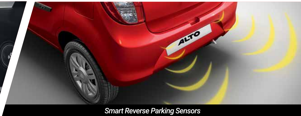
Smart Reverse Parking Sensors