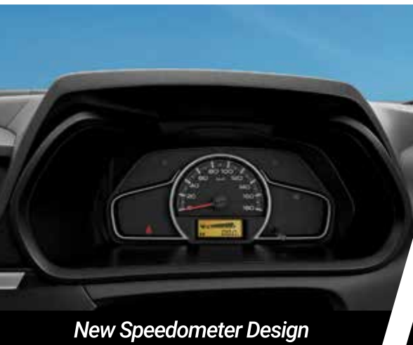
New Speedometer Design