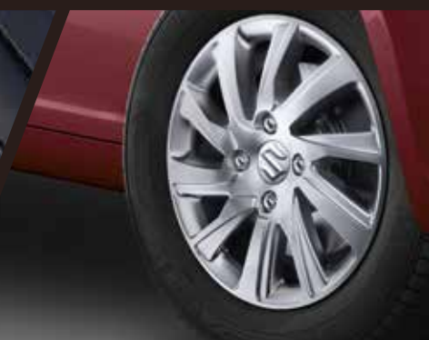
Motion Themed Alloy Wheels