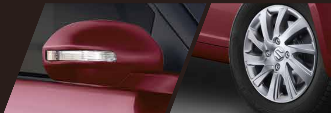
Electrically retractable ORVMS with Side Turn Indicator

You might want to get used to appreciation and applause. With elegant features and premium looks, get ready to unlock a world of sophistication. So, when you take it out for a spin, the world will admire the sheer class you own.