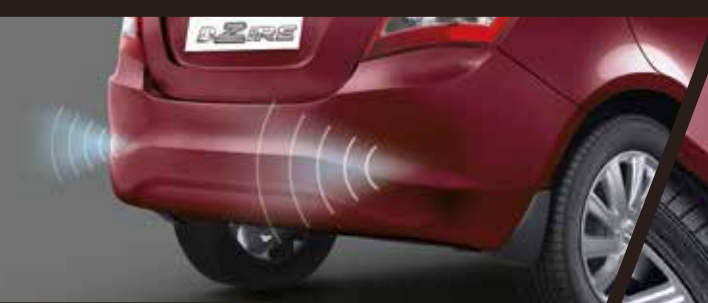
Reverse Parking Sensors