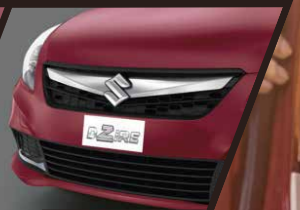
Front Grill with Chrome