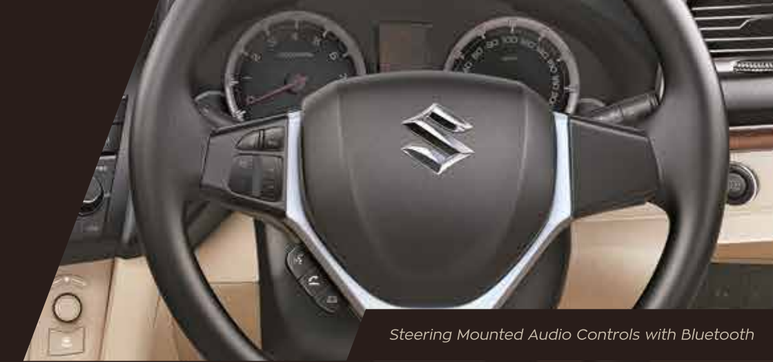
Steering Mounted Audio Controls with Bluetooth

Sink into the comfort of Dzire and open your door to indulgence. Richer taste, aesthetically done interiors and roomy cabin space with a promise of class. Get ready to experience the finer things in life.