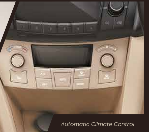
Automatic Climate Control