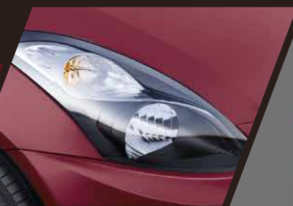
Black Tinted Headlamps