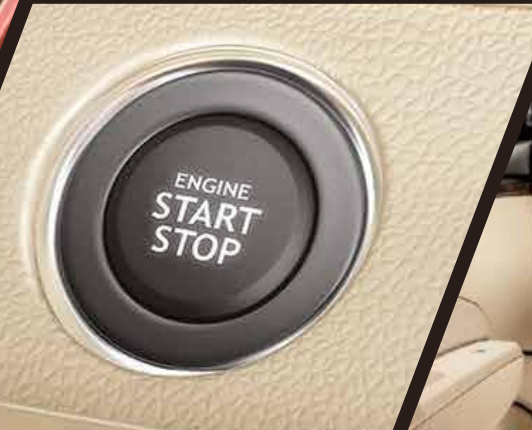
Push Start Stop Button